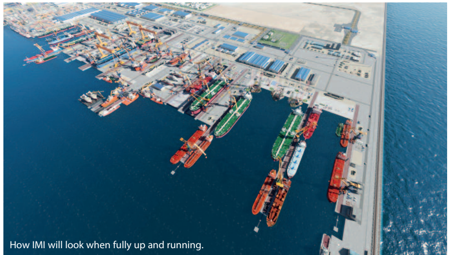
How IMI will look when fully up and running.

The rig construction zone is scheduled to come on stream in 2019, followed in 2020 by a ship construction zone, where it is understood the building of VLCCs for Bahri has been agreed in