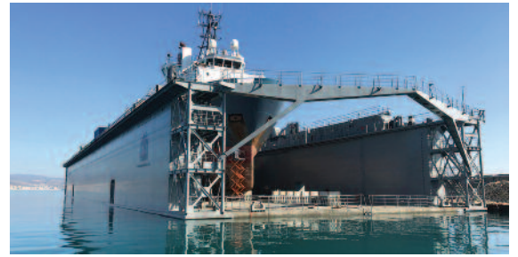
ABB Turbocharging signed an agreement at Posidonia with Multimarine Services (MMS) shipyard in Limassol Port, Cyprus to open a turbocharging service point.

The deal confirms the creation of the first turbocharging service point in Limassol to be located at a shipyard, after proactive discussions between ABB Turbocharging Greece & Cyprus and MMS to relocate ABB's local service facilities.