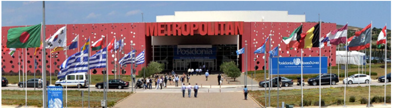
PHOTO FROM POSIDONIA 2016